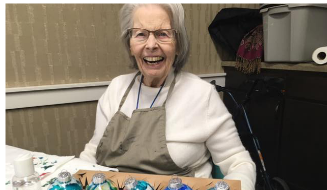
Ornament decorating using alcohol-ink!