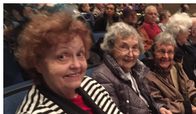
Fantastic concert put on by Kennedy High School! We're so glad we got to go.